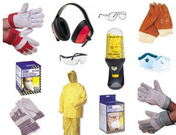
Figure 3: Personal Protective Equipment